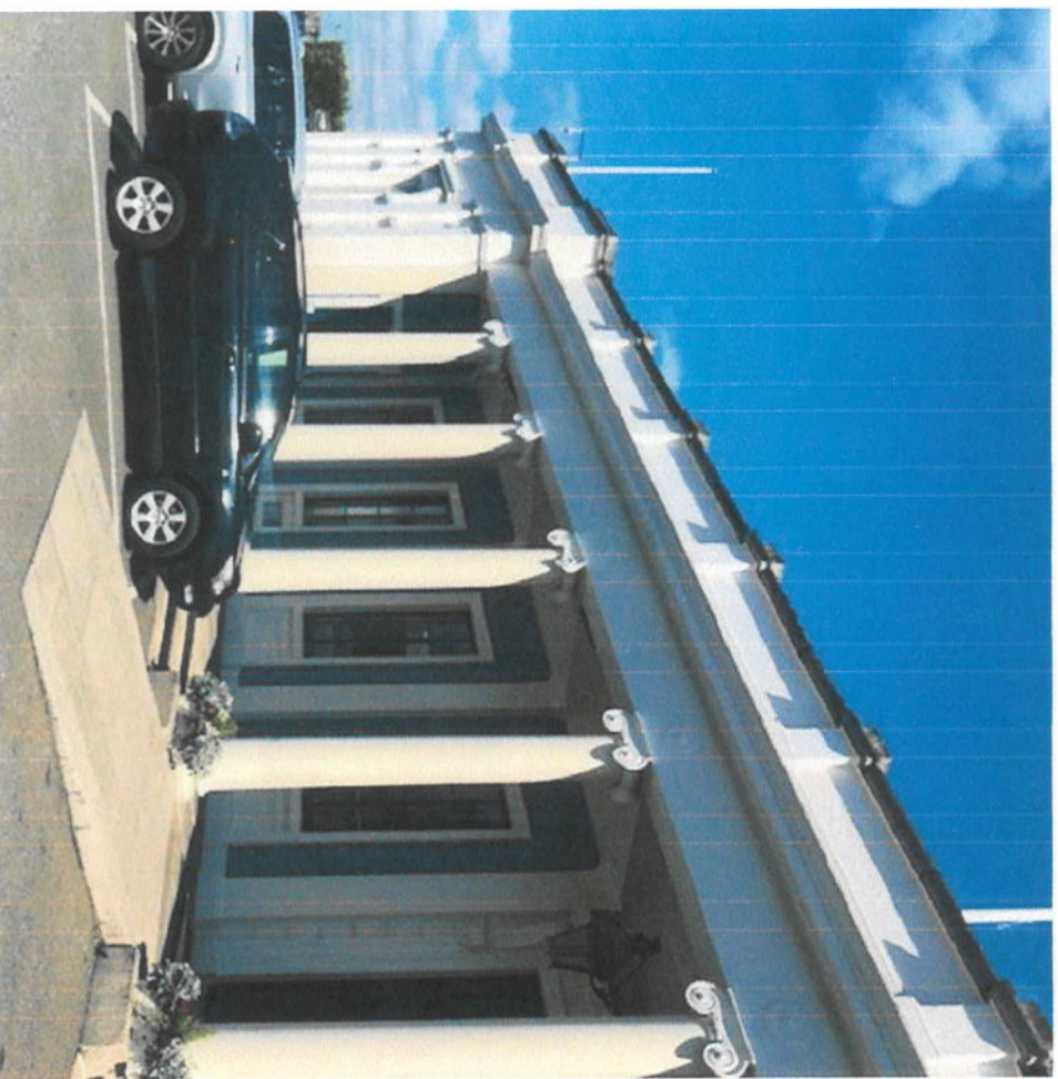
ELEVATION AFTER PAINTING