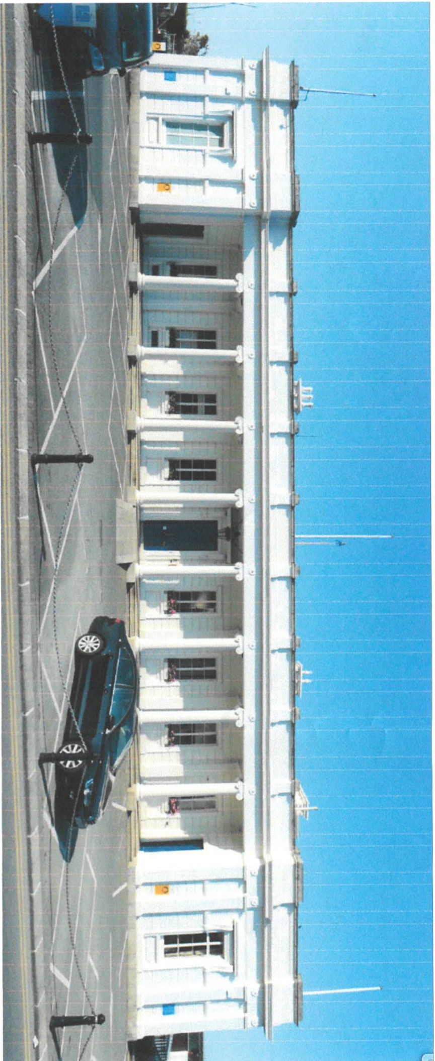
ELEVATION PRIOR TO PAINTING